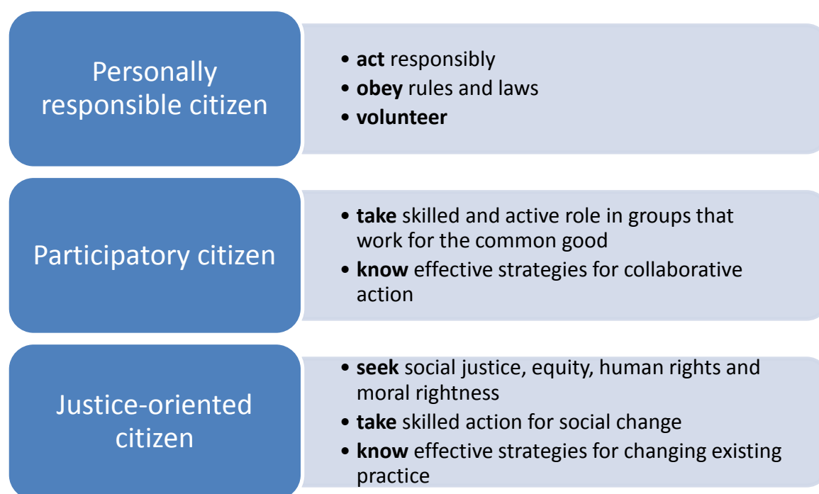
Figure 1: What kinds of citizens do we want?